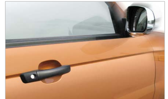
Sedan type door handle & chrome outside mirrors