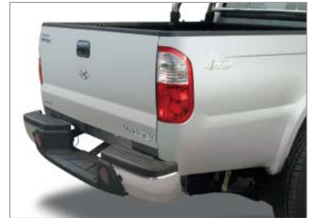
Rear step bumper