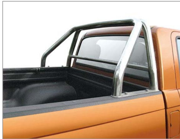
Plastic paint & stainless steel rail