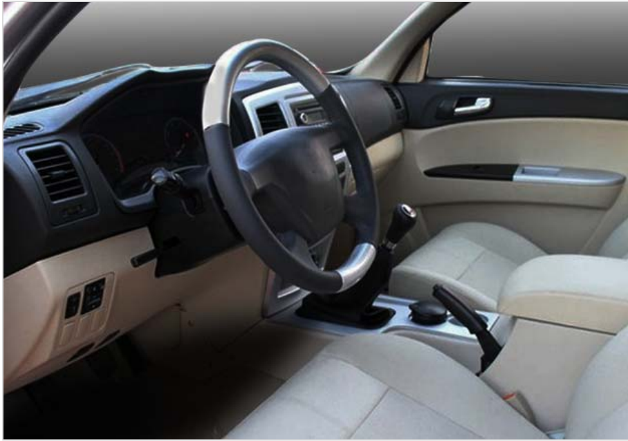
Beige interior trim