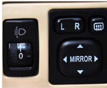
Head light adjustor & Power outside mirrors switches