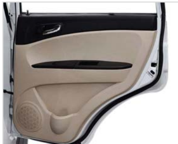
Right hand side door