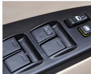
Power windows switches