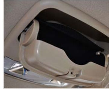
Overhead sunglass box