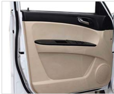
Left hand side door