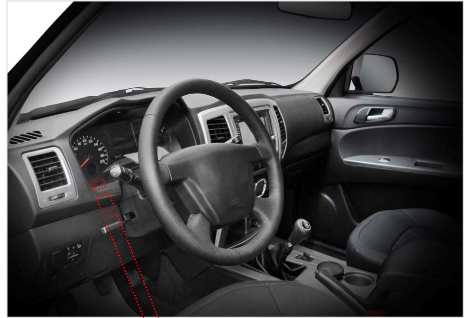
Grey interior trim