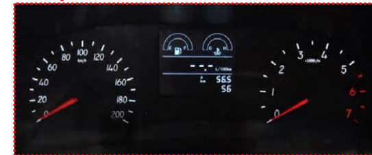
Progress black face meters