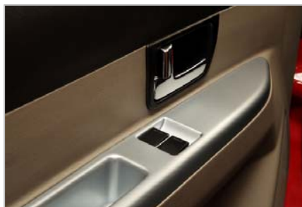
Front power windows