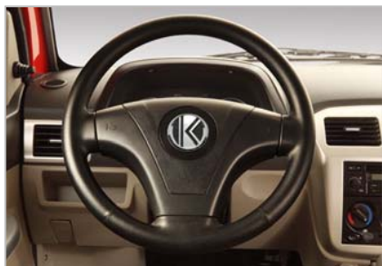
3-spoke steering wheel