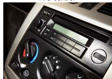
AM/FM radio with MP3 port