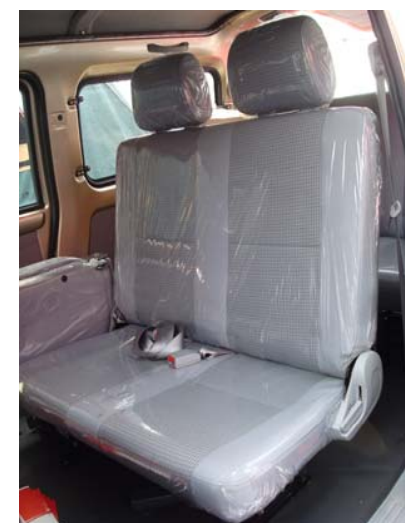
2nd row seats (with 1 folding seat)